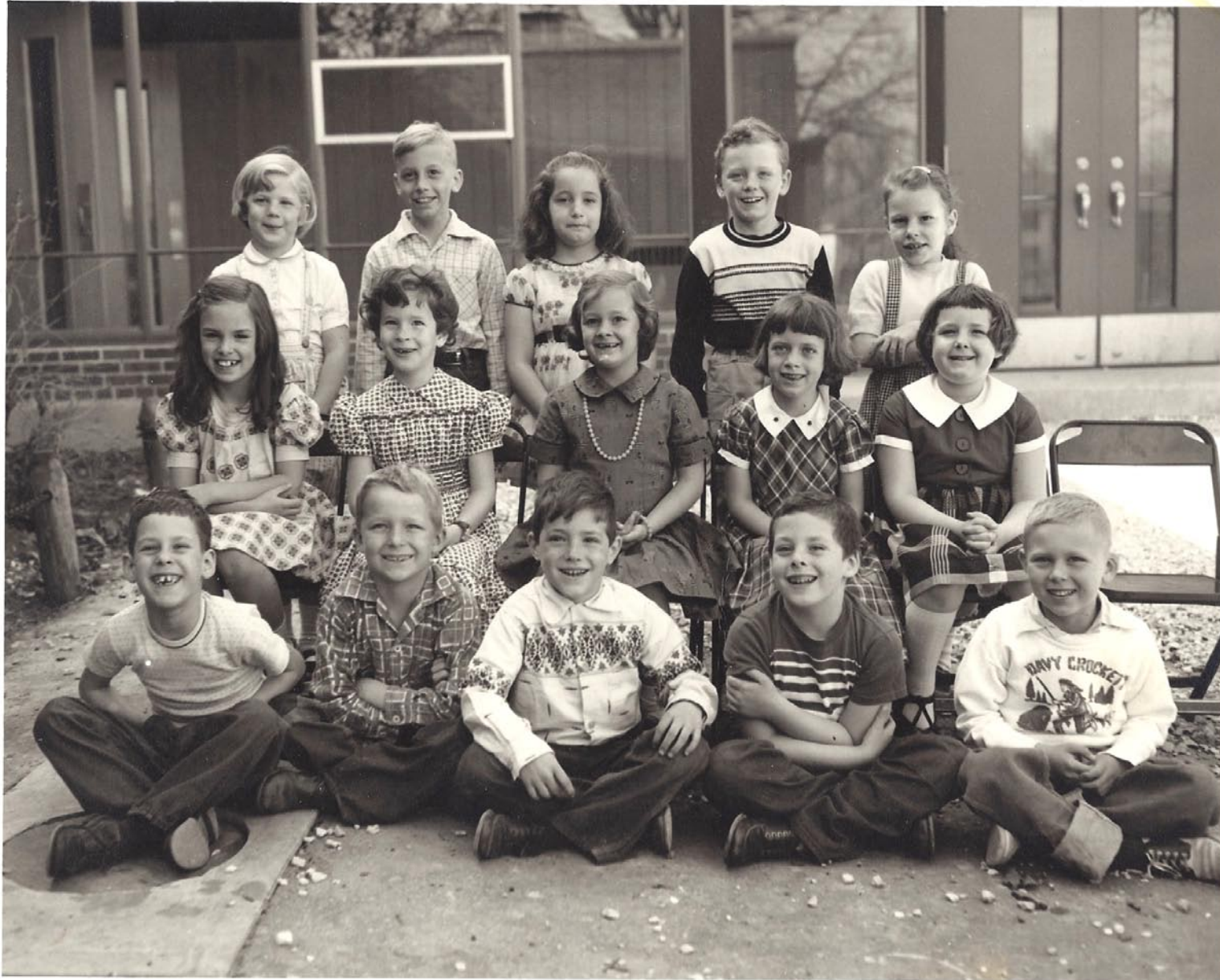
First Grade- Green Bay Road School