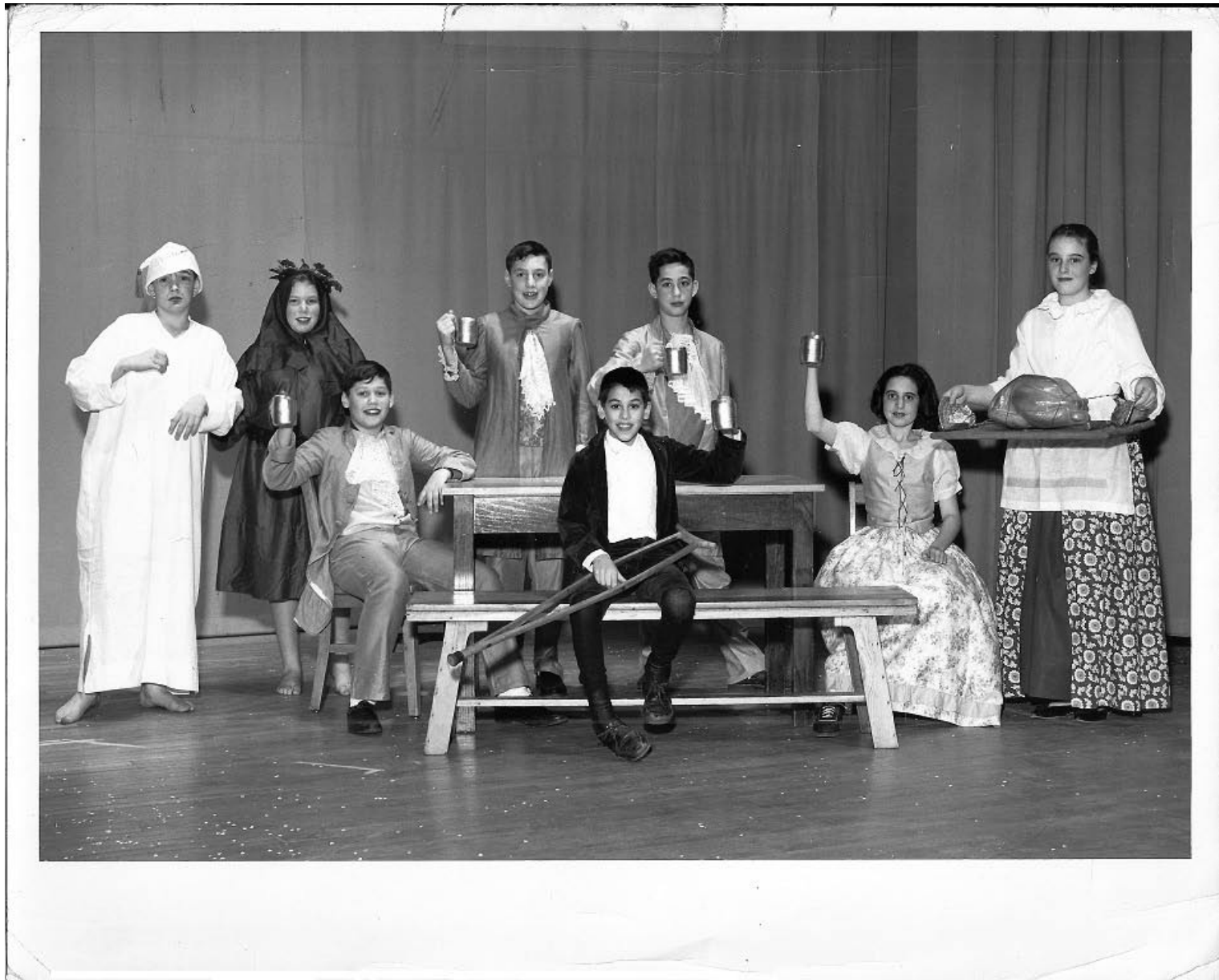
Elm Place School - December, 1961 - Seventh Grade - "A Christmas Carol"