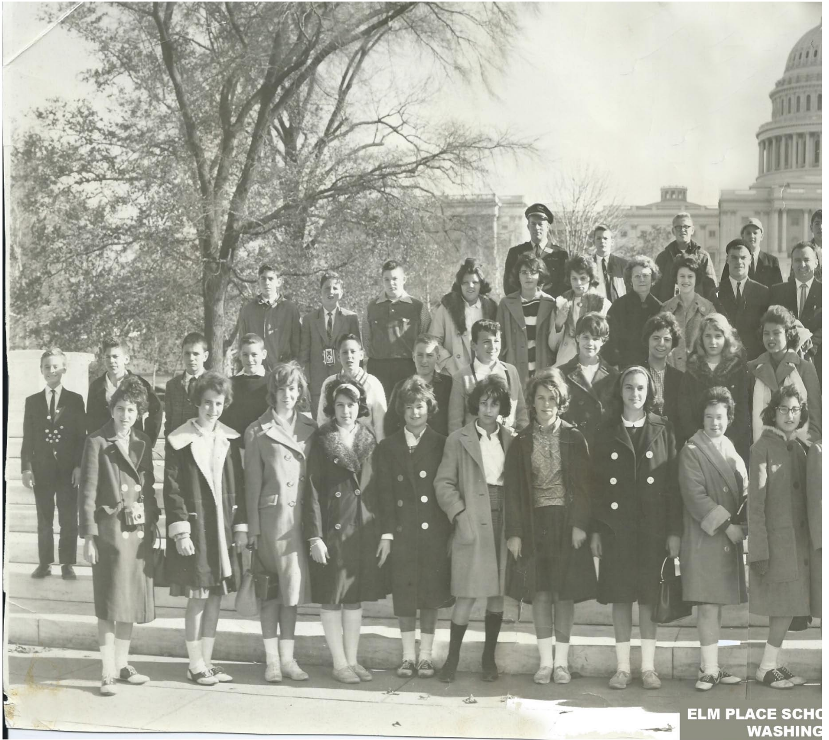
ELM PLACE SCHOOL WASHINGTON