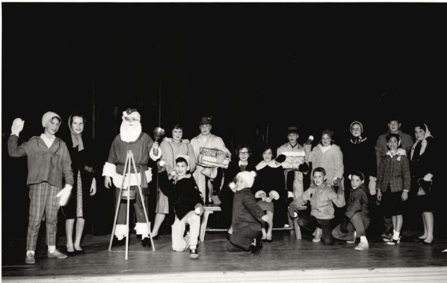
1961 Christmas Pageant-- Each Seventh Grade Class did a different vignette with a song.