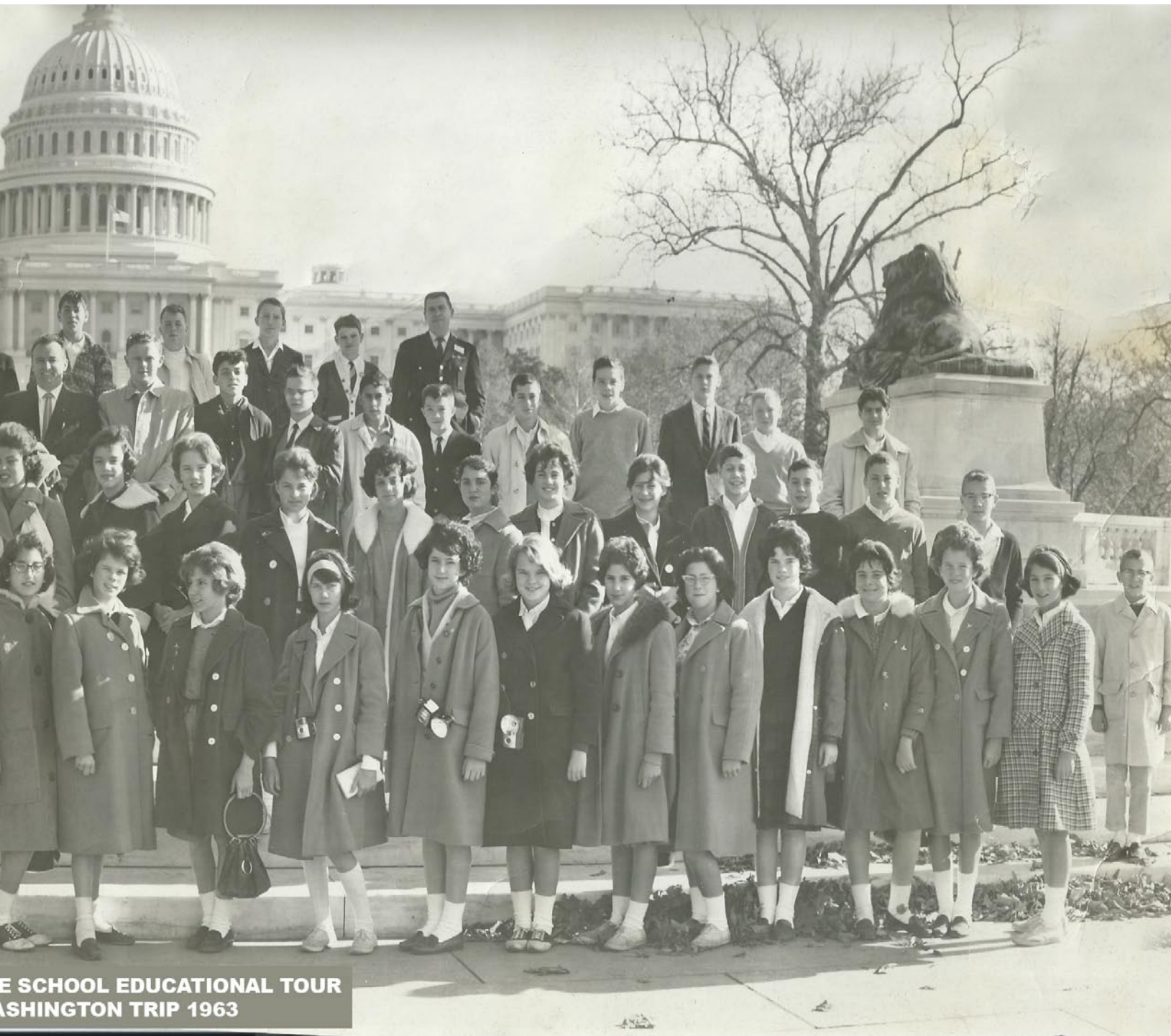
SCHOOL EDUCATIONAL TOUR WASHINGTON TRIP 1963